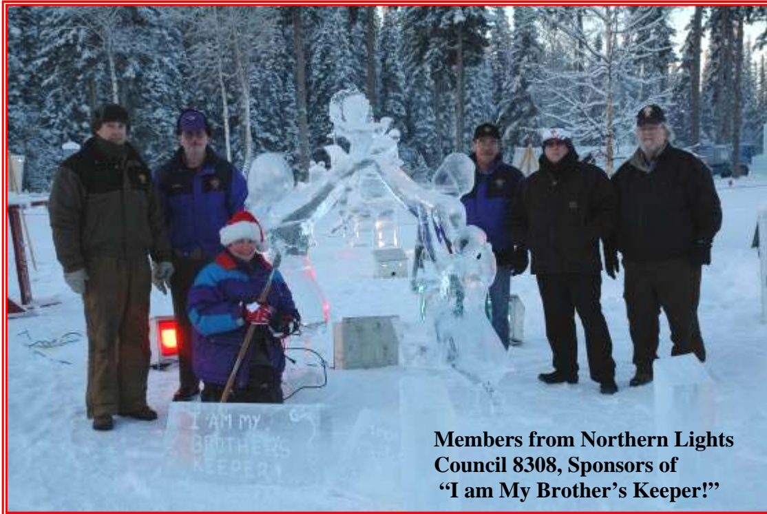
Members from Northern Lights Council 8308, Sponsors of "I am My Brother's Keeper!"