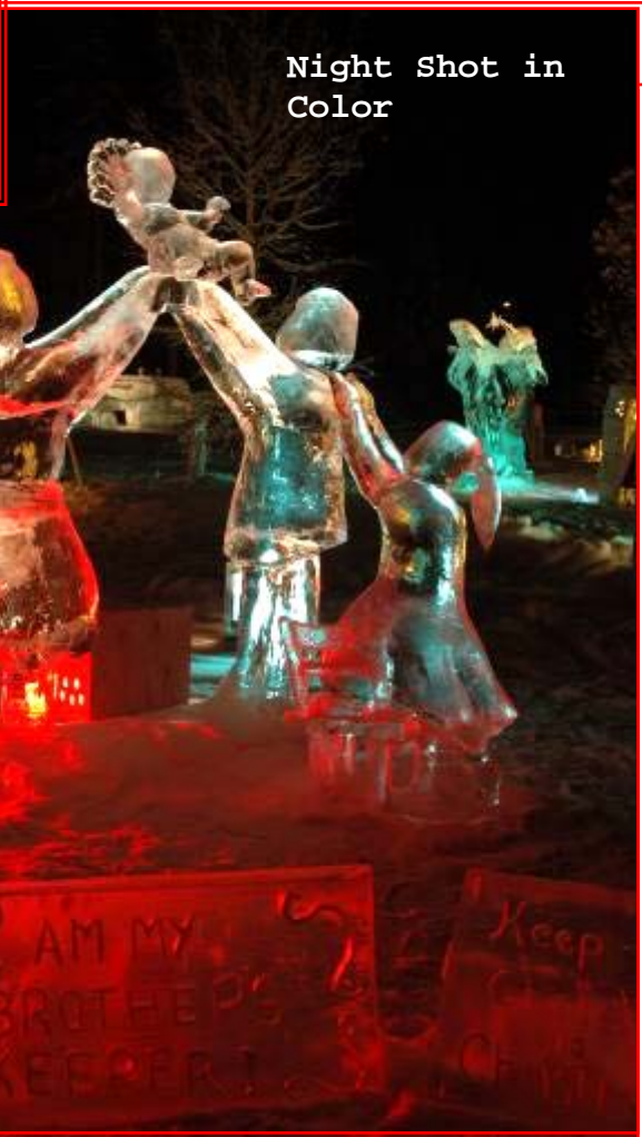
Night Shot in Color